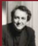
Peter Phillips Director The Tallis Scholars